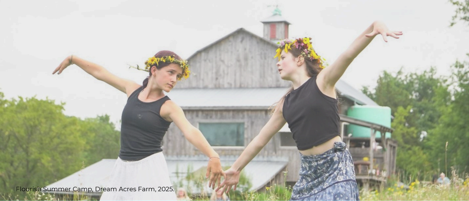
Flourish Summer Camp, Dream Acres Farm, 2025.