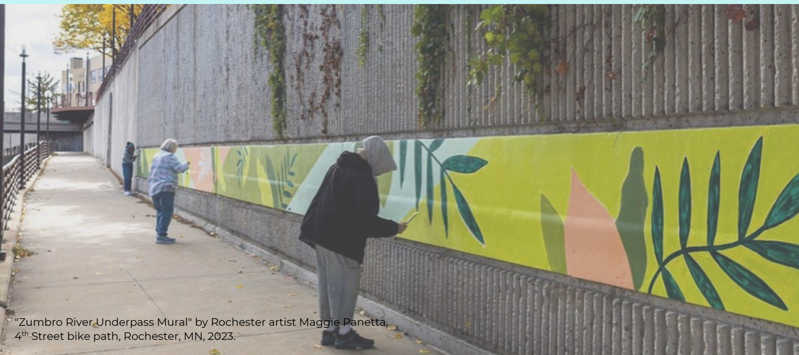
"Zumbro River Underpass Mural" by Rochester artist Maggie Panetta, 4 th Street bike path, Rochester, MN, 2023.

Applicants who are not selected will remain in the applicant pool for future selections until they are funded, or program funds are exhausted.